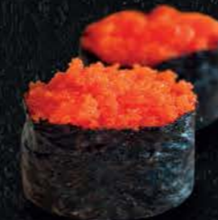
27 Ebiko Shrimp roe $2.40 (2 pcs)