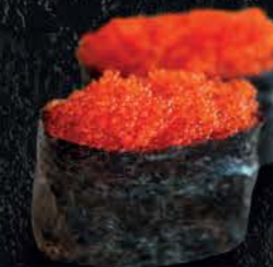
28 Tobiko Flying fish roe $2.40 (2 pcs)