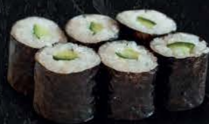
12 Kappa Maki Cucumber $2.40 (6 pcs)