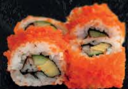
11 California Maki Avacado, egg, cucumber, crab stick, shrimp roe & mayo $2.90 (4 pcs)