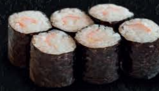
14 Kani Maki Crab stick $2.40 (6 pcs)