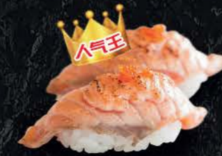
17 Salmon Belly Mentaiyaki Half cooked salmon with mentai sauce & flying fish roe $3.90 (2 pcs)