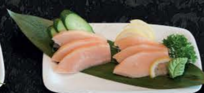
04 Kajiki Sashimi Swordfish $5.00 (3 pcs) $9.50 (6 pcs)