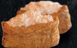
26 Salmon Mayo Inari $3.90 (2 pcs)