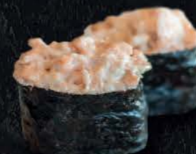
31 Salmon Mayo $2.60 (2 pcs)