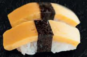
18 Tamago Sushi Japanese omelette $2.40 (2 pcs)