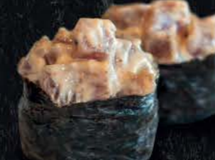
32 Spicy Tuna Mayo $2.60 (2 pcs)