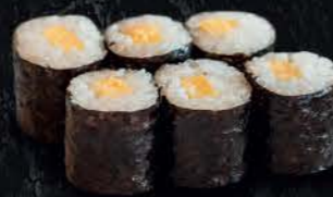
13 Tamago Maki Japanese omelette $2.40 (6 pcs)