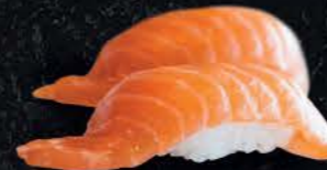
19 Salmon Sushi Salmon $2.60 (2 pcs)