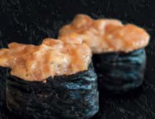
30 Spicy Salmon Mayo $2.60 (2 pcs)