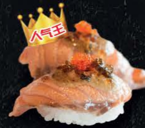
15 Aji-ichi Aburi Salmon Half cooked salmon with special sauce, century egg & spring onion $3.50 (2 pcs)