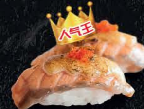
16 Salmon Misoyaki Half cooked salmon with miso sauce, flying fish roe & seaweed flakes $3.50 (2 pcs)