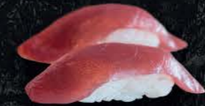
20 Maguro Sushi Tuna $2.60 (2 pcs)