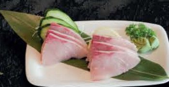
03 Hamachi Sashimi Yellowtail $5.00 (3 pcs) $9.50 (6 pcs)