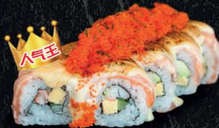
09 Aburi Miso Salmon Roll Salmon, flying fish roe, avocado, egg, cucumber, crab stick & miso sauce $13.90 (8 pcs)