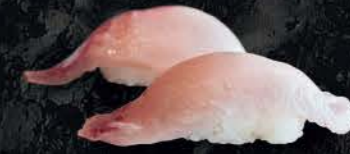
21 Hamachi Sushi Yellowtail $2.80 (2 pcs)