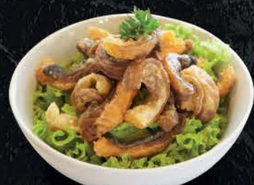
34 Fried Salmon Skin $2.90