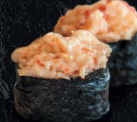
29 Lobster Salad $2.60 (2 pcs)