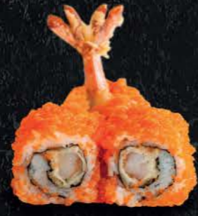
07 Tempura Maki Tempura prawn, shrimp roe & mayo $2.90 (3 pcs)