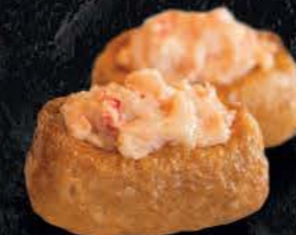
24 Lobster Inari $3.90 (2 pcs)