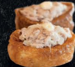
25 Tuna Mayo Inari $3.90 (2 pcs)