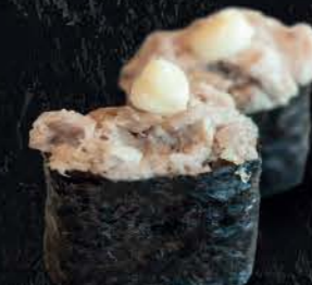
33 Tuna Mayo $2.60 (2 pcs)