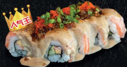
08 Aji Special Maki Salmon, century egg, flying fish roe, avocado, egg, cucumber, crab stick, spring onion & special sauce $13.90 (8 pcs)