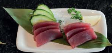
02 Maguro Sashimi Tuna $4.50 (3 pcs) $8.50 (6 pcs)