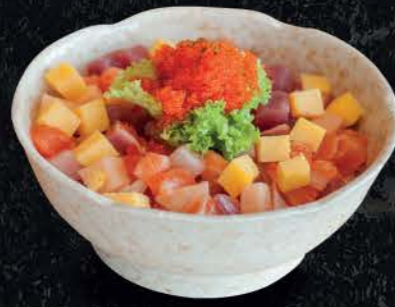
06 Chirashi Don Assorted raw fish, egg, flying fish roe & lettuce $14.90