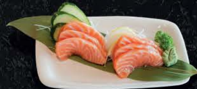
01 Salmon Sashimi Salmon $4.50 (3 pcs) $8.50 (6 pcs)