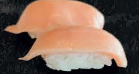
22 Kajiki Sushi Swordfish $2.80 (2 pcs)