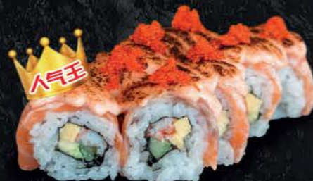
10 Mentai Yaki Roll Salmon, flying fish roe, avocado, egg, cucumber, crab stick & mentai sauce $14.90 (8 pcs)