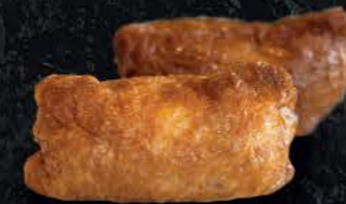
23 Inari Sushi Sweet beancurd $2.40 (2 pcs)